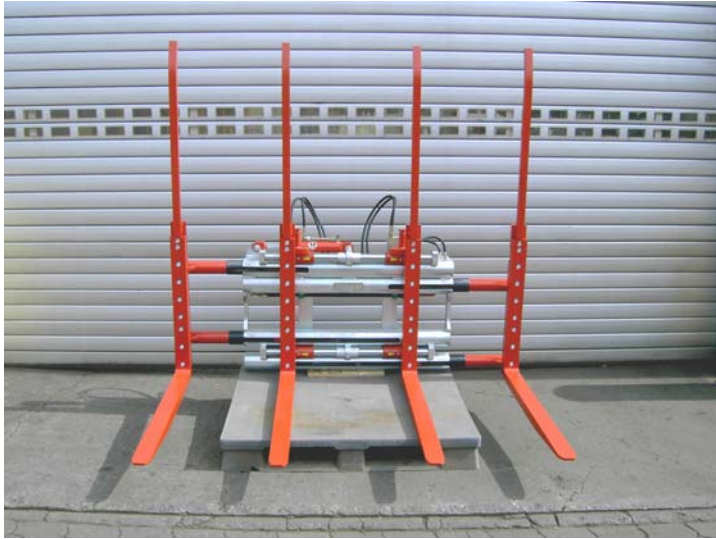
Clean design with fewer parts. Forks move evenly with flow division.