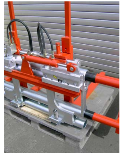
Lower steel heel rollers