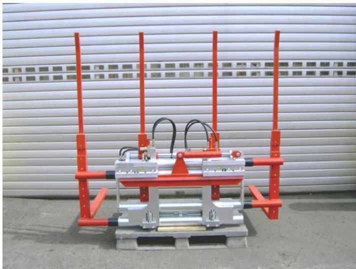
Rear view showing clean design and HD sideshift mechanism