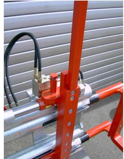
Inner fork braking system gets rid of the gas spring problems.